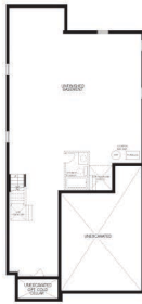
LOWER LEVEL STYLE 'A'