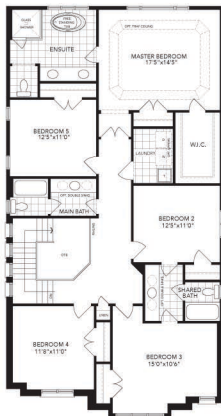
OPT. 5 BEDROOM SECOND LEVEL STYLE 'A'