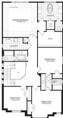
SECOND LEVEL STYLE 'A'